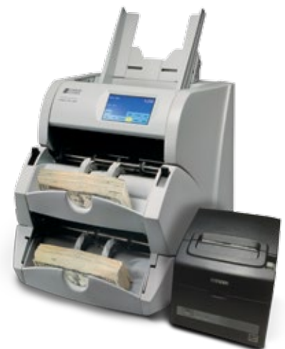
Shown with optional thermal printer

Choose counterfeit detection based on your needs, from basic all the way up to the most advanced counterfeit detection in the industry. Counterfeit detection sensors instantly identify counterfeits with a series of tests including magnetic, ultraviolet, fluorescent, infrared and Cummins Allison's proprietary detection techniques.