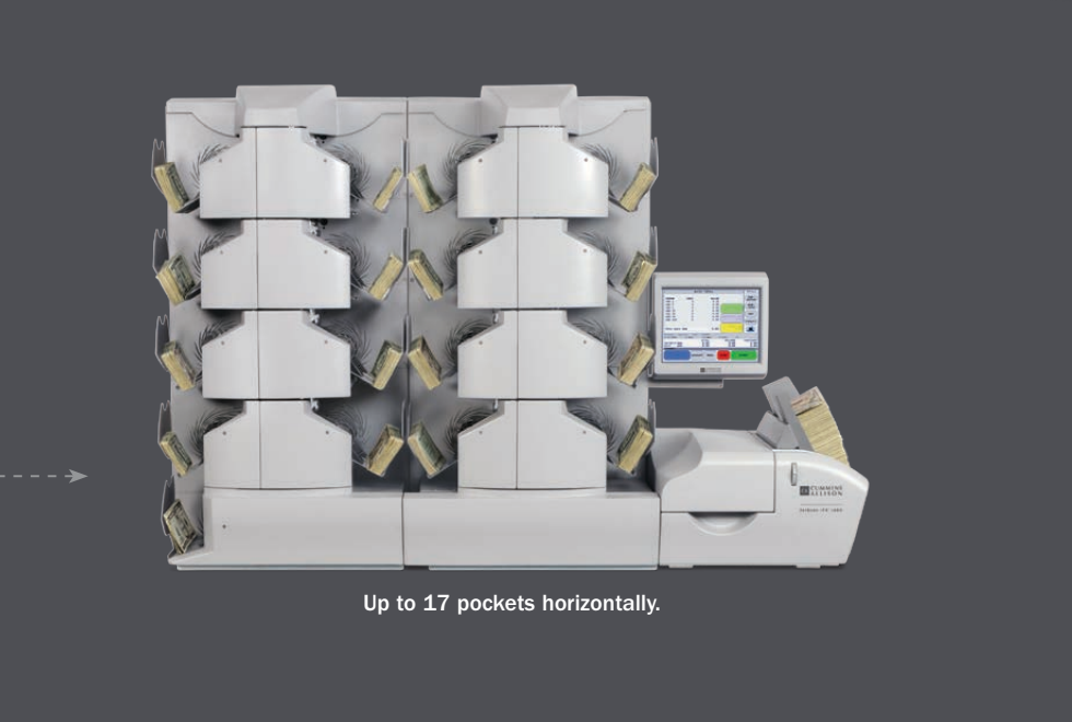
Up to 17 pockets horizontally.