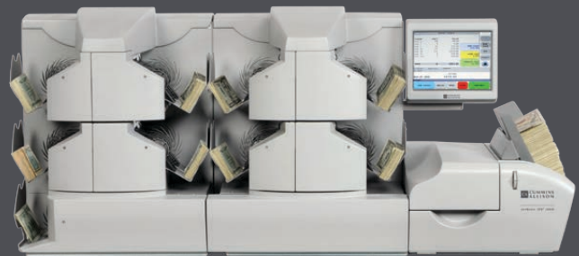
...or 9 pockets horizontally.