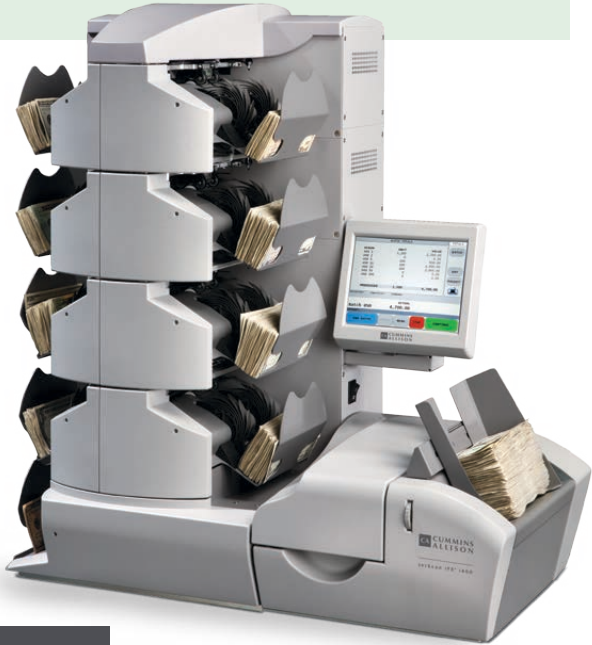
Compact 9 pocket vertical.