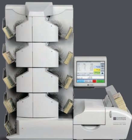
Expand to 9 pockets vertically...

Navigating to frequently used count and sort operations takes less time and effort. For even greater functionality, choose the One Touch Plus operating software to create multiple processing types, enter coin and non-cash items into batch totals, and accommodate future processing features.