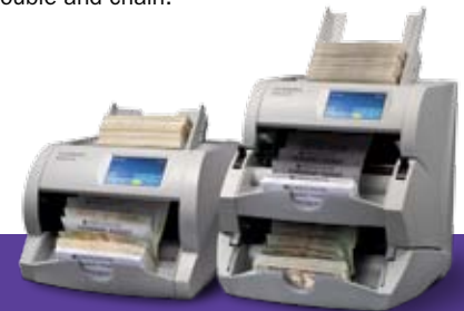
JetScan iFX i100

Detection: Auto size, automatic document type, MICR character no-read, piggyback, double and chain.