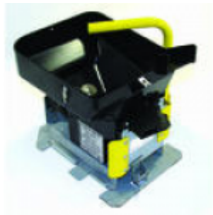
Cyclone, Medium Capacity