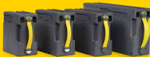
600 Notes 900 Notes 1,200 Notes 2,200 Notes